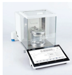
Microbalance XA 52.5Y.M.A.P