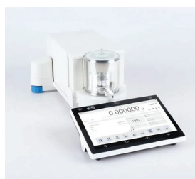
Microbalance MYA 21.5Y.P

The highest measurement accuracy is ensured using microbalances and analytical balances of 5Y series, equipped with a special adapter for pipettes calibration. The adapter is characteristic for an evaporation ring which minimizes occurrence of errors in the course of pipettes calibration. Both the instruments, a microbalance and an analytical balance, can be used for performance of standard weighing processes. For this purpose, all the operator needs to do, is to disassemble the adapter.