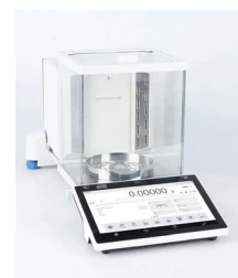
Analytical balance XA 82/220.5Y.A