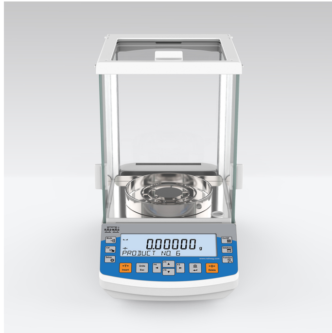
The drawings, photos and graphics used are for illustrative purposes only.