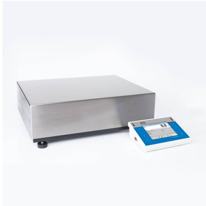
The drawings, photos and graphics used are for illustrative purposes only.

More information on the website mirror.radwag.com/en/info,w1,DD4