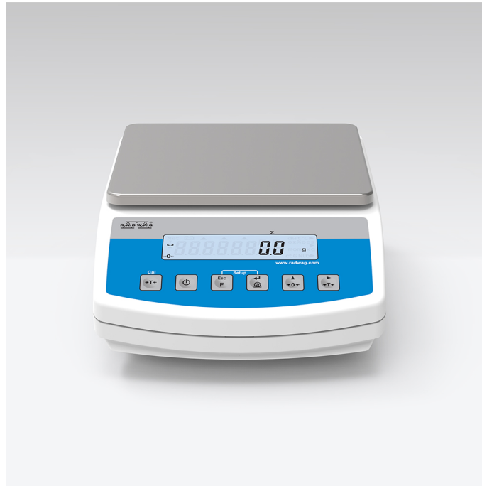
The drawings, photos and graphics used are for illustrative purposes only.