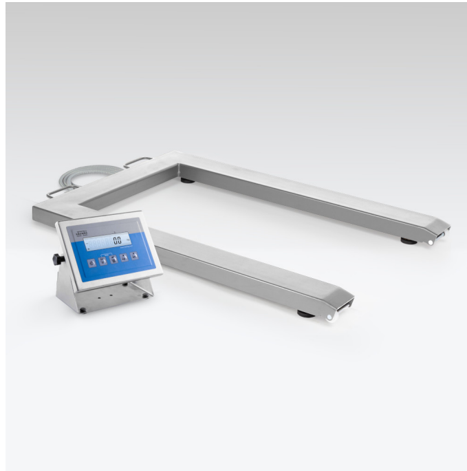
The drawings, photos and graphics used are for illustrative purposes only.