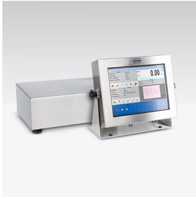
The drawings, photos and graphics used are for illustrative purposes only.