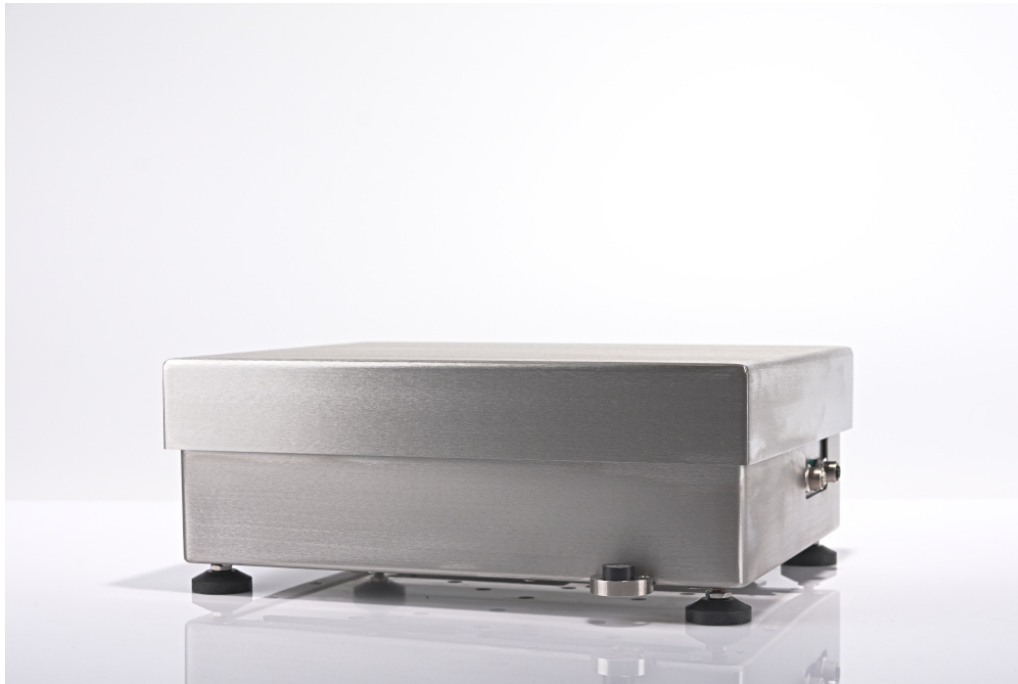
The drawings, photos and graphics used are for illustrative purposes only.

More information on the website mirror.radwag.com/en/info,w1,314